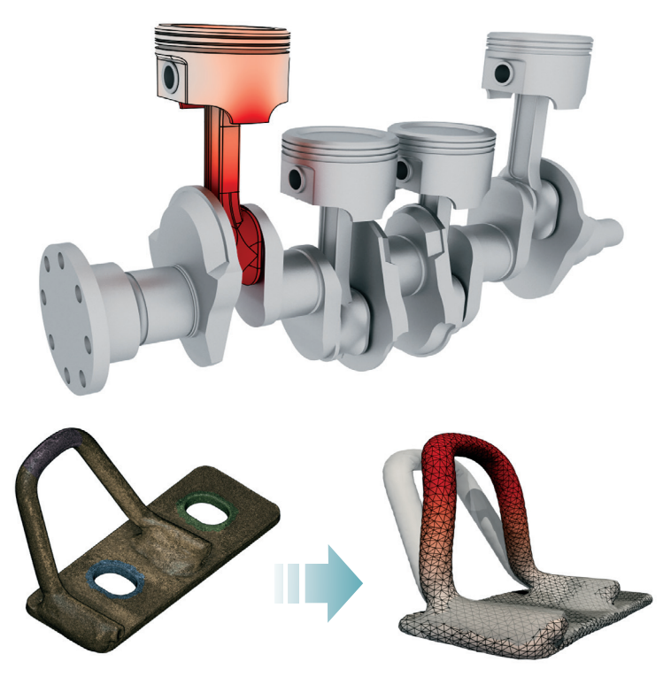
Coreform IGA can run simulations directly on STL surface meshes.

Contact, Plasticity, Implicit & Explicit, Static, Dynamic, Large Deformation