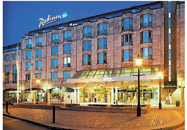
Radisson Blu Scandinavia Hotel